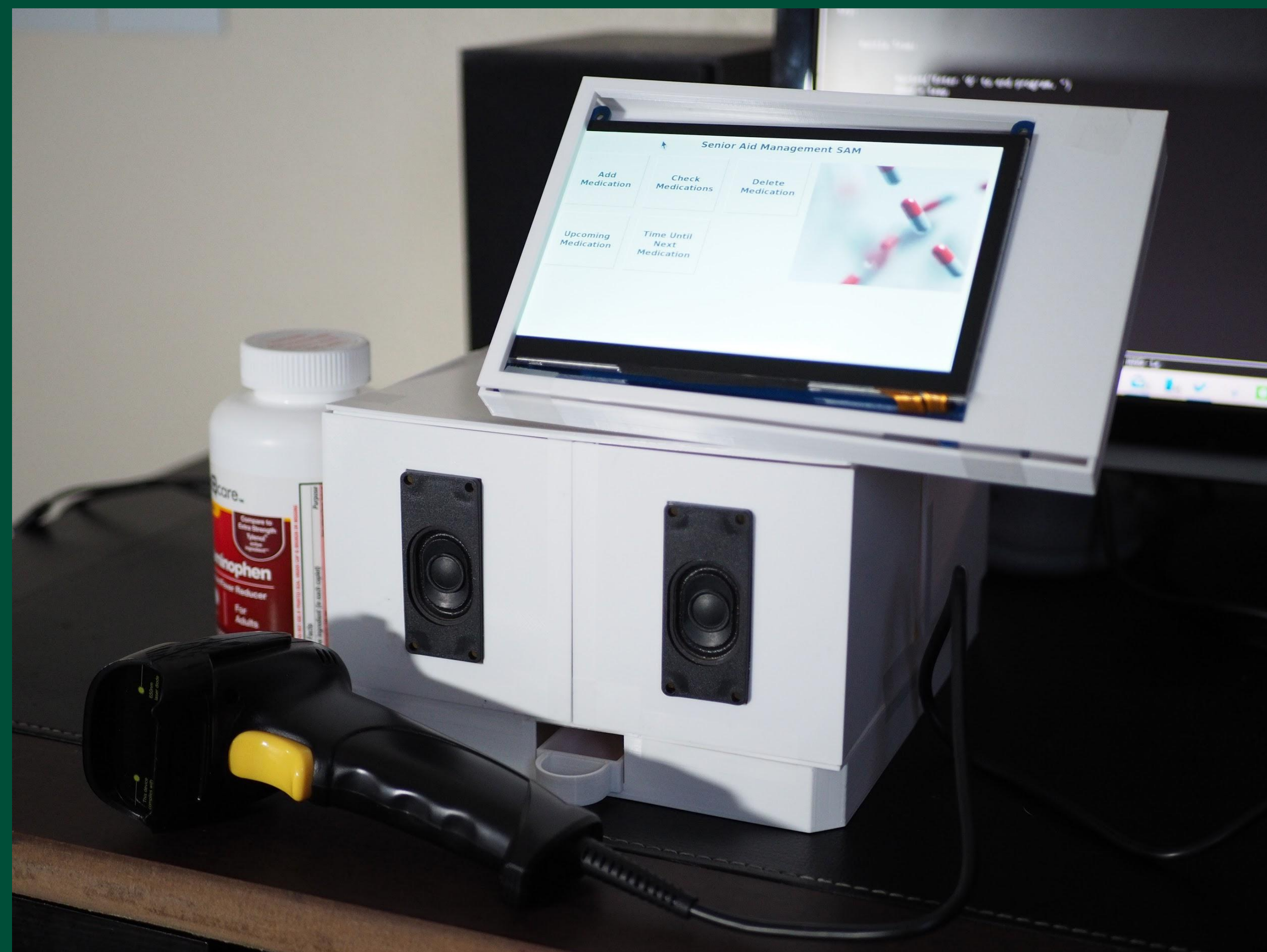
Figure 1: The Senior Aid Management

For seniors, having a proper medical schedule they can follow is very important for their health.